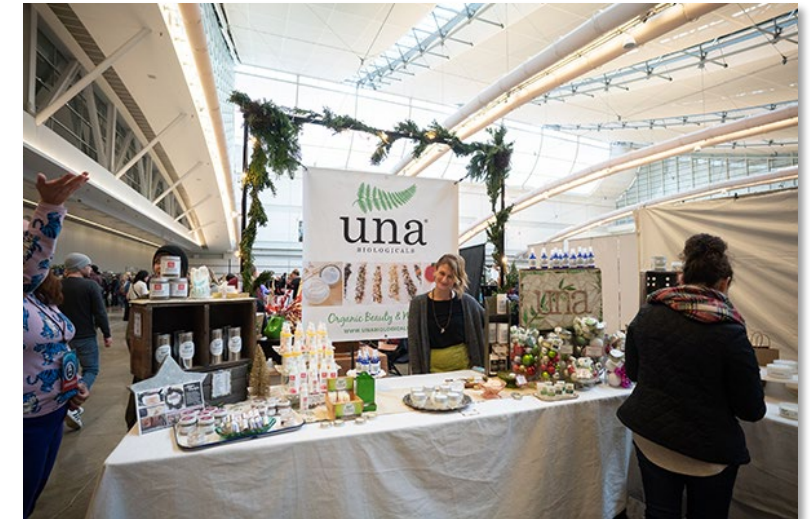
Commonwealth Press and una biologics: Both started as vendors and are now sponsors.